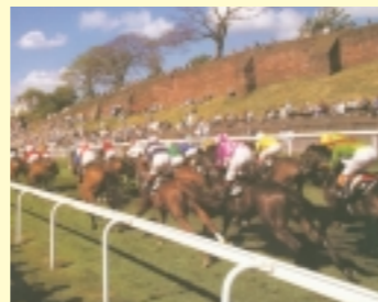
Chester - nearly 500 years of racing