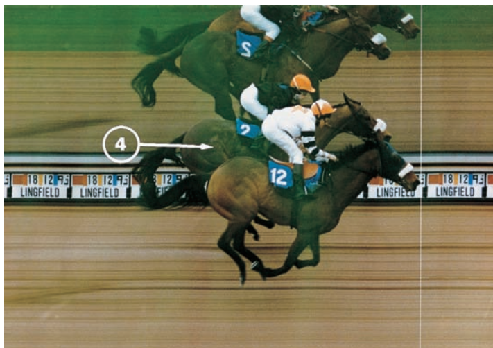
Photo finish prints are available for all races

We appreciate that not everyone can drop everything and rearrange their diaries at short notice to take in a day's racing. But there are lots of ways to check on your horse's performance... The Racing Post's website ( www.racingpost.co.uk ) provides live text commentary for every race – as well as runners and detailed results in every edition. Alternatively bookmaker's sites and betting shops also provide live coverage and commentary is provided by premium call services advertised on the racing pages of the national press. Sky Sports have a daily Racing News Slot