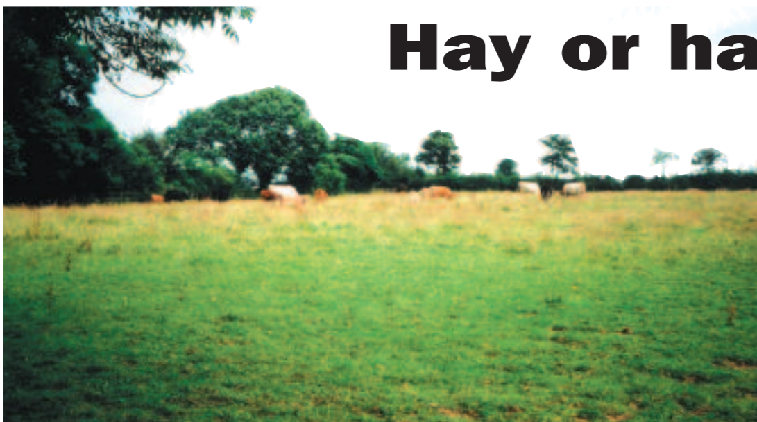
Cattle grazing down rough summer grass at the Homebred Stud for next year's hay

The Hungerford Stakes and The Criterion Stakes as well as being beaten a short head in a Group 1 at Woodbine, USA. He's from a star spangled female line which has provided seven individual Group 1 winners including Hennessy and Editor's Note. Arkadian Hero is by Tremolino who was winner of the Arc de Triomphe and is himself sire of Group 1 winners Snow Polina, Juvenia, Germany and Dernier Empereur. His first foals will reach the racetrack as two year olds in 2005. We are hoping that this match will produce a smart flat type who would stay up to a mile and a quarter. It's said to be impossible to plan to breed a grey but we'll be hugely surprised if this one isn't!