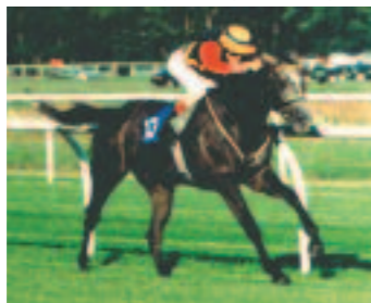
Snowy Mantle winning by 8 lengths at Nottingham

The Hungerford Stakes and The Criterion Stakes as well as being beaten a short head in a Group 1 at Woodbine, USA. He's from a star spangled female line which has provided seven individual Group 1 winners including Hennessy and Editor's Note. Arkadian Hero is by Tremolino who was winner of the Arc de Triomphe and is himself sire of Group 1 winners Snow Polina, Juvenia, Germany and Dernier Empereur. His first foals will reach the racetrack as two year olds in 2005. We are hoping that this match will produce a smart flat type who would stay up to a mile and a quarter. It's said to be impossible to plan to breed a grey but we'll be hugely surprised if this one isn't!