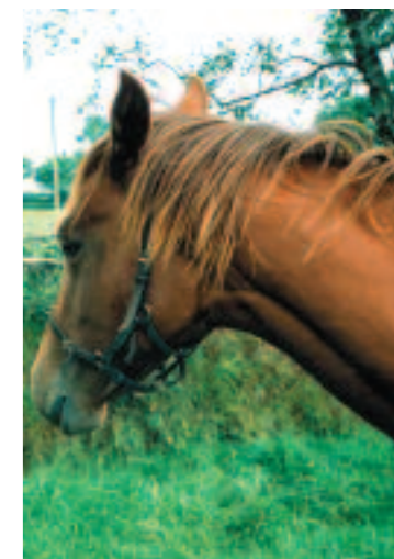
Phizz - now being broken

Our Pharly filly ' Phizz ' is a lovely individual too with a pedigree to match. She's from a top class jumping family including Grade 1 Chase and Cheltenham Festival winners - but, at the moment she looks