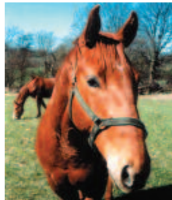
Bugsie - into training this year

Homebred Racing has plenty to look forward to. Horses already in training include Quidditch who we hope, will at last, fulfil the promise shown at home after her summer break. We'll concentrate on the flat with her. Homebred Star has shown plenty of speed and after being gelded will also be campaigned on the flat.