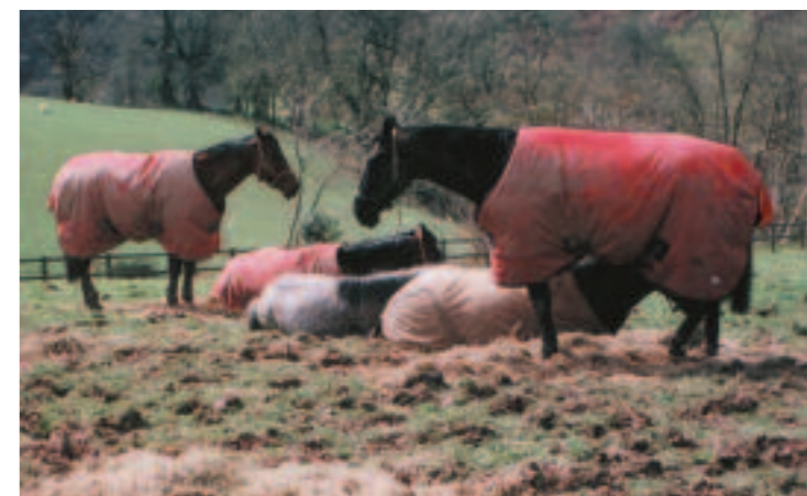
All rugged up and enjoying some winter sun and mud