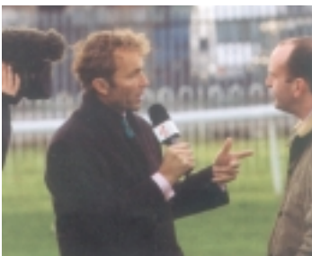
John Francome in his current role

John Francome on being quizzed about not continuing his career as a trainer: "If you're at the top I think there's really good money in training. But there are too many downsides to it - It's 24 hours a day... It's a lot of effort... and maybe I'm just a lazy bugger!"