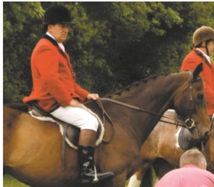
'Ianto', with our winning hurdler Prince des Galles, who starred in the show

The Hunt is an observational documentary and followed the Tivyside in Pembrokeshire and the Llanwnnen and District Farmers in West Wales, from Christmas 2004 to New Year's Day 2006. "We get inside the heads of the locals in the 'rural tribes', as I call them, in West Wales where there are more people hunting per population than anywhere in the country" said Davies. "There are some laughs, but also the down points. In one programme we show the devastation of lambs killed on a