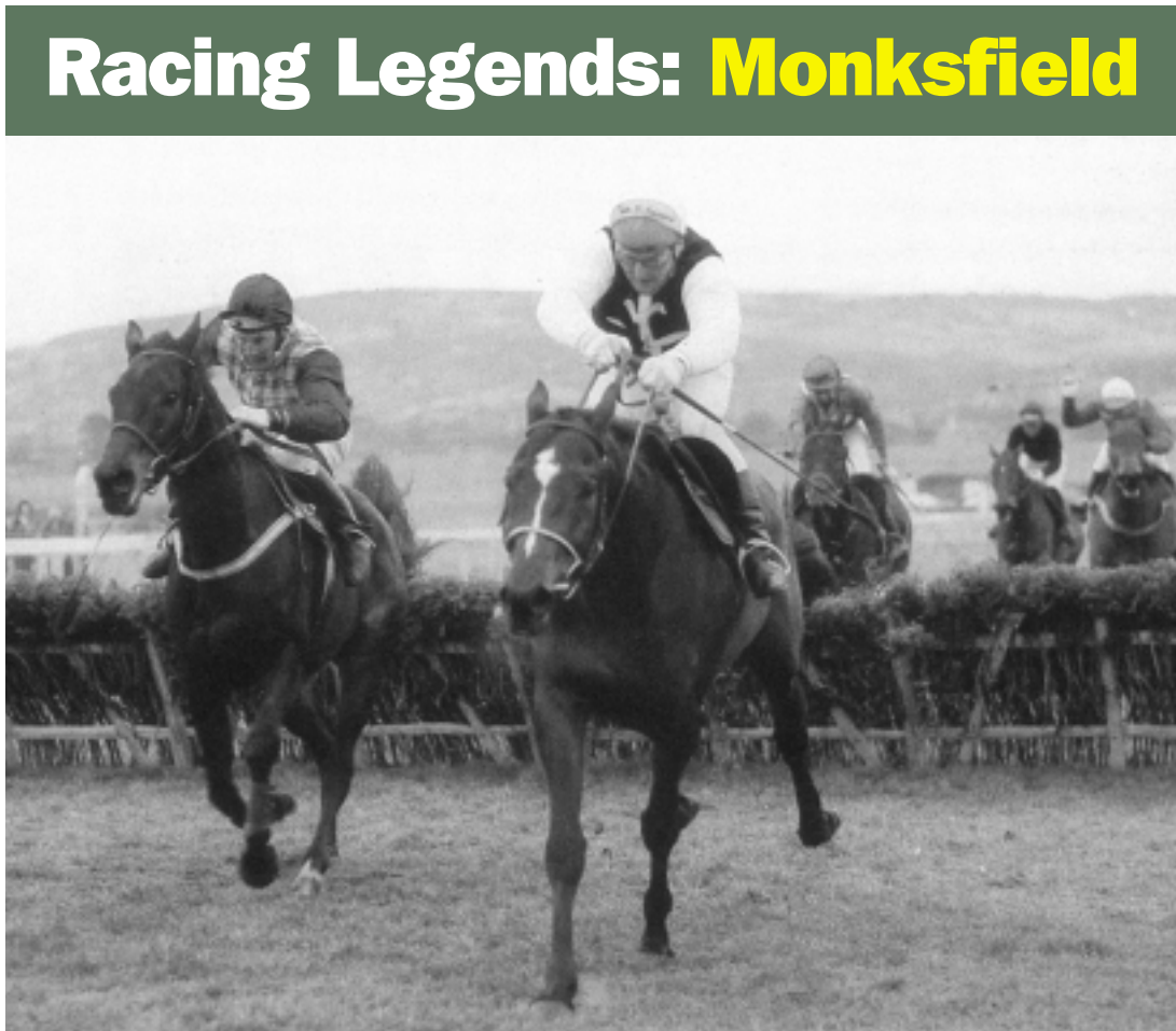
Monksfield heads Sea Pigeon in the 1978 Champion Hurdle

Pretty Polly burst onto the racing scene at Sandown Park in 1903 with one of the most amazing racecourse debuts ever seen. She finished so far in front of her rivals that racegoers imagined there had been a false start! But 15 consecutive wins that included The Champagne, The Cheveley Park and The Middle Park Stakes, The 1000 Guineas, Oaks and St Leger, all by emphatic margins proved that she was a superstar. Pretty Polly also proved to be a great broodmare and lived to the ripe old age of 30.