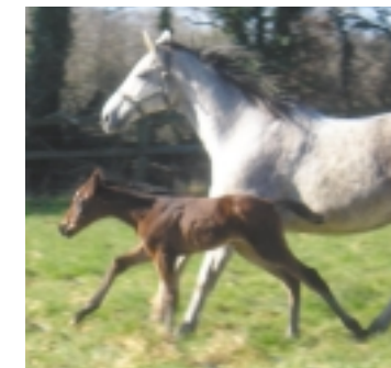
...but by day 3 we're galloping!

relative of Dubai Millennium may yet produce a superstar. Let's hope he just has!