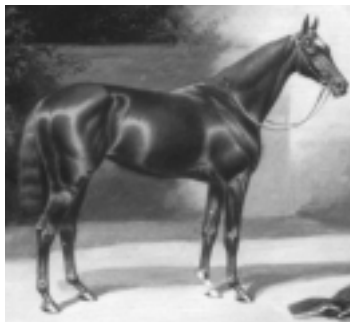
The legendary Pretty Polly