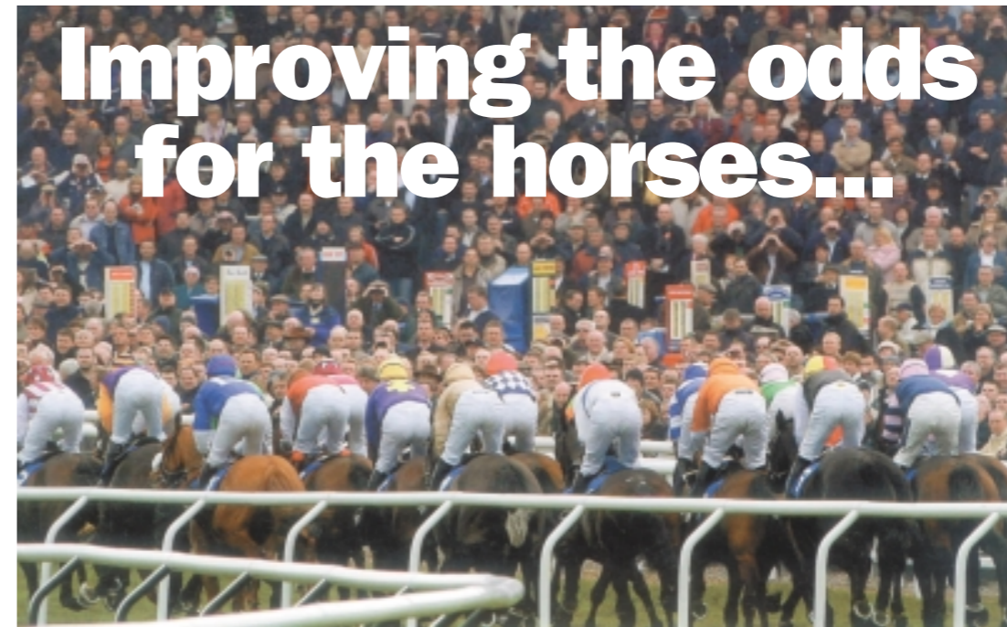
The runners set off for another race at the Cheltenham festival

This year's Cheltenham Festival sadly underlined the risk for horses. The unacceptable toll followed hot on the heels of the existing debate about racecourses providing suitable ground to prevent injury - and Homebred racing has been campaigning for changes to race programming to help (see p.2). The ground may, or may not, have been a factor at the festival, but race times were alarmingly fast - some 7 or 8 seconds quicker than standard which is equivalent to a furlong! Given that the ground was riding on the soft side of good on the opening days and good on the others suggests that jockeys must, in part at least, be responsible. As all drivers are reminded - speed kills and this is clearly true of jump racing. Issues, of course, surround the horses themselves and it's a growing trend that flat horses now go on to race over obstacles.