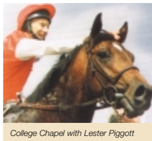
College Chapel with Lester Piggott

When walking across 'Front' field at the stud to check the mares on one of the rare fine sunny evenings of mid summer, Sarah heard a 'whoosh' followed by a loud thud behind her. It turned out to be a fish which had dropped from the clear blue sky! Although no birds - or poachers - were visible it seems that the 11lb fish was dropped from a great height by a passing gull, cormorant or heron. All very fishy!