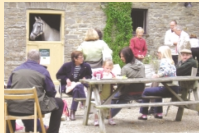
Broodmare Gran Cliquot keeps an eye on visitors!

48 hours later at the Royal Welsh Show. It was ultimately a long day for their Master and Huntsmen as the sudden arrival of summer meant tractors worked late into the night cutting our hay.