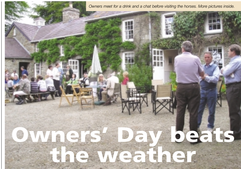
Owners meet for a drink and a chat before visiting the horses. More pictures inside.

Ascot has become the latest addition to the select group of courses to receive the ROA Gold Standard Award. Ascot's prize-money is unsurpassed among British courses, totalling £9.4 million in 2007/08, thanks in part to an executive and sponsorship contribution of 50.9%. The course has also enhanced its hospitality for owners with runners, expanding their complimentary food offering to include a substantial buffet. Gold Standard activity is set to continue in the coming weeks, with Chester agreed as the next course to receive the award.