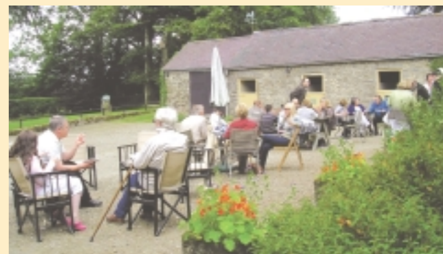
Buffet lunch in the stableyard