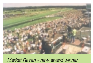
Market Rasen - new award winner