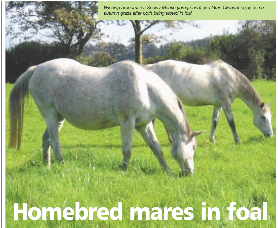
Winning broodmares Snowy Mantle (foreground) and Gran Clicquot enjoy some autumn grass after both being tested in foal.

Irish bookmaking firm Paddy Power and SIS have also confirmed their interest. From 1 September, due to a change in the advertising laws, betting firms have been allowed to advertise around racing broadcasts.