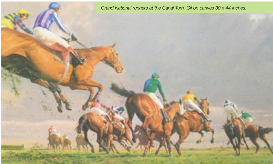
Grand National runners at the Canal Turn. Oil on canvas 30 x 44 inches.