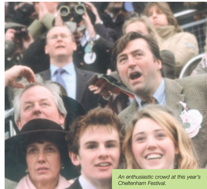
An enthusiastic crowd at this year's Cheltenham Festival.