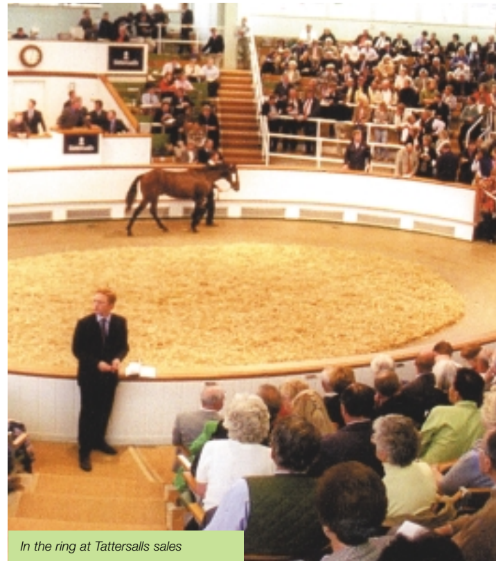
In the ring at Tattersalls sales

We often compare racing to the music industry - a few superstars at the top make a fortune whilst the rest are all wannabes. This pursuit of 'the dream' puts a totally unrealistic gloss on the whole industry. Bloodstock at the top end of the market continues to fetch record prices for horses to be trained in pursuit of ever diminishing prizemoney. We constantly hear of general dissatisfaction with prizemoney and very vocal threats citing this as the reason to quit or cut back. But point - to - pointing, where costs are only marginally less expensive, continues to boom even though prizes are in the tens rather than thousands of pounds. There are equally loud complaints about too much racing reducing the quality - but the reality is that lower grade races are just as competitive. And there's no lack of entries because, despite an increasing of fixtures, the number of horses balloted out of races also continues to rise. Personally I doubt that levels of prizemoney have any bearing on whether owners want to be involved or not. Of course it would be great to have big prizes - but just to be involved is the thrill - and to