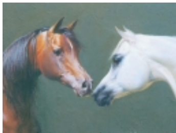
Study of 2 Arabs