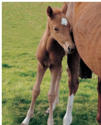
Celtic Chimes last foal by Safawan - now a yearling

Our winning chesnut mare by Celtic Cone has already bred us a 2-y-o winner Welsh Assembly. She is also dam of Henna who is one to make her racecourse debut early in the New Year. Celtic Chimes was rested last year but is now in foal to one of Britain's most consistent winner producers - Most Welcome. Her foal is due in May.