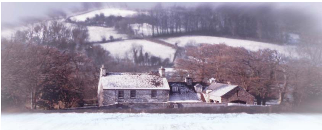
Homebred's stud at Llandysul, Ceredigion during the last snowfall